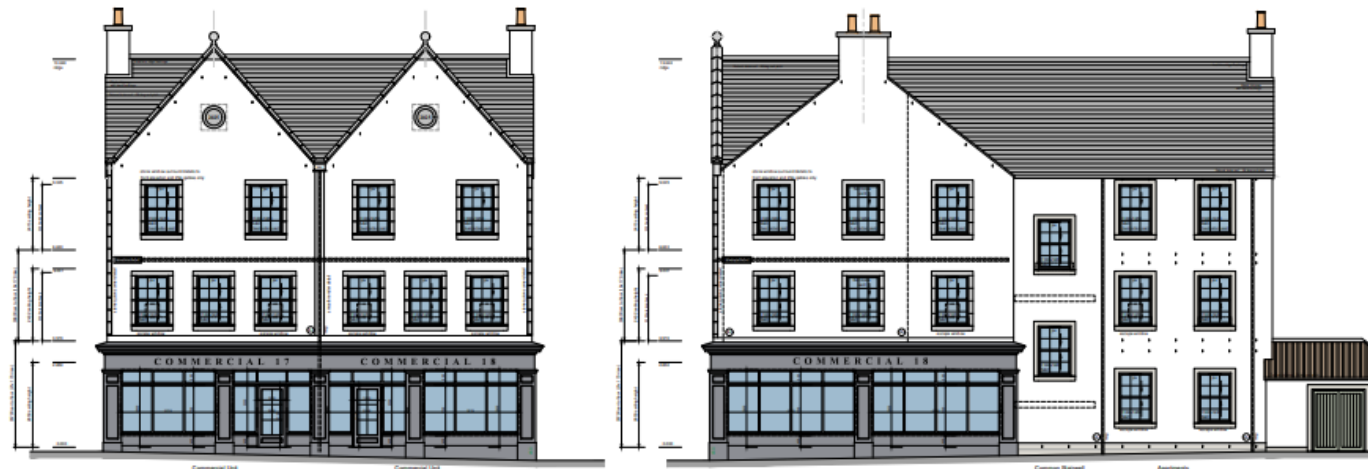
Front Elevation D 1:100