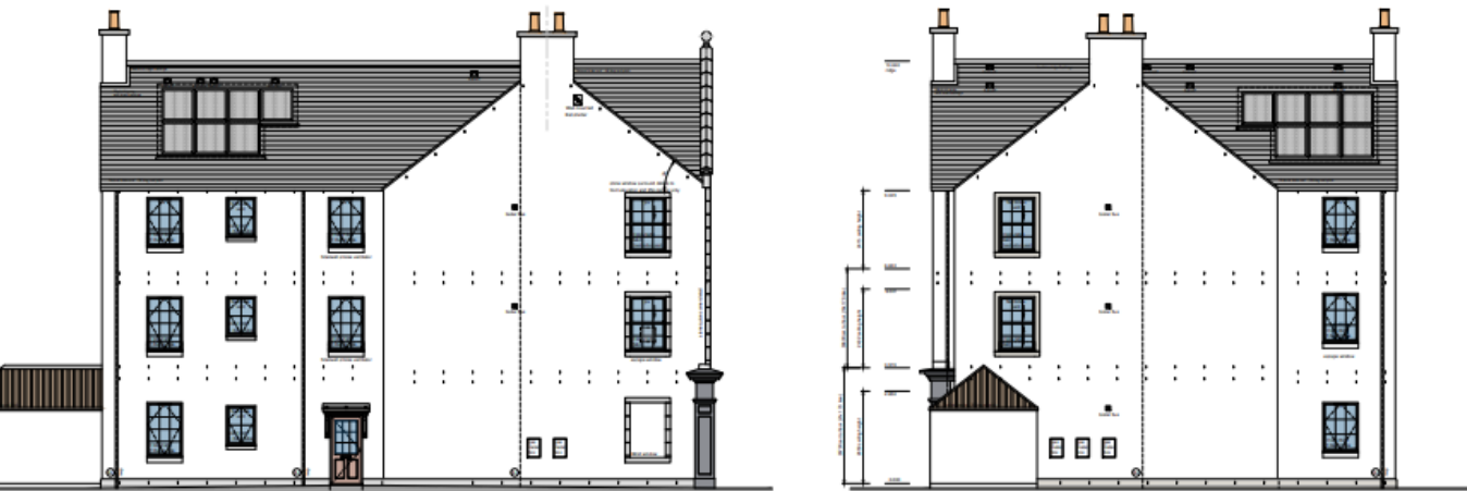
Rear Elevation C 1:100