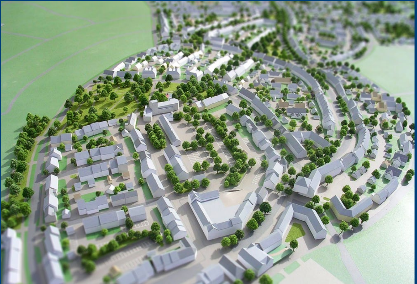
Above: Model of Cairnhill

Elsick Development Company will be inviting you to our launch events in association with the town's three house building firms - AJC Homes, Stephen and ZeroC Holdings.