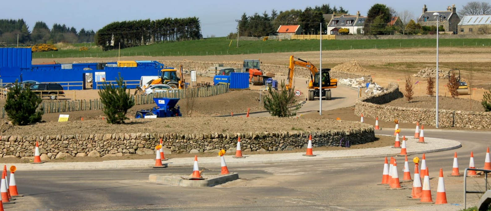
Above: Model of Cairnhill